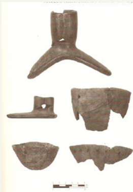
Stone pipes and clay pots from McLean Mound, Time Before History

tained grave offerings placed with specific bundles or scattered throughout the mound. The offerings included bone and shell beads, chipped-stone and antler arrow points, pottery shards, animal bones, grinding stones, paint pigments, and stone smoking pipes. Archeologists agree that more research in these mounds needs to be conducted in order to determine their relationship to the Native culture. 9