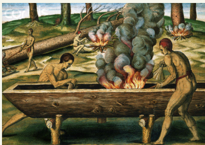
1590. Hand-Colored Engraving by Theodor de Bry of "The Manner of Making Boats" by John White

They hollowed out the canoe by setting a fire inside it and then by scraping the inside with tools. They alternated between scraping and burning. Mud was placed at the ends and sides to help control these fires. 2