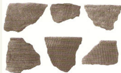
Middle Woodland Pottery, Top Row: Hanover Pottery, Bottom Row: Cape Fear Pottery, Time Before History

The people that produced the dugout canoe at the museum are classified as the Waccamaw Siouan Indians and at this time period, they belonged to the cultural phase called Cape Fear during the Middle Woodland Period (300 B.C. – A.D. 800). The Waccamaw Siouan also inhabited Brunswick County. Most of what is known about this cul-