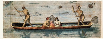
1590, Hand-Colored Engraving by Theodor de Bry of "Their Manner of Fishing in Virginia" by John White

inside a dugout canoe even while carrying a considerable amount of cargo with them. The canoes were used for hunting, fishing, and for transporting food and raw materials. 3