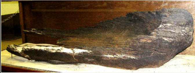
Waccamaw Siouan Canoe Fragment on Display at Museum

Just under The First Inhabitants exhibit, lies the oldest artifact at the museum. The artifact is a portion of an Indian canoe, over 2,000 years old. The canoe attests to the culture and technology of the Indians of the Middle Woodland period.