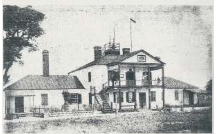
Early view of Officers Quarters following establishment of United States Signal Service station (1880s or 1890s).

Fort Johnston served several functions during the American Civil War. Firstly, it defended the inside of the Western Bar or the main entrance to the Cape Fear River. Secondly, it defended the back of Fort Caswell. Thirdly, it was used as a recruiting and training station for Confederate Army units. Finally, it was used as the headquarters for General W.H.C. Whiting's Chief Engineer of the Cape Fear District, General Louis Hebert. The Louisiana native had been captured by the Yankees at the Battle of Pea Ridge, later paroled. He was also captured at the Battle of Vicksburg and paroled again. Hebert's role in the construction of Cape Fear forts is sometimes overlooked. Little of note happened at Fort Johnston until the end of the war. Exhaustion from work, intertwined with boredom, and worry over an impending attack from Federal Naval and Land Forces, were the main enemies to its Rebel garrison.